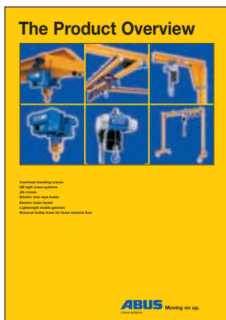
The Product Overview

You can also view these directly and download them from our homepage.