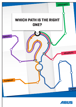
□ The new HB system