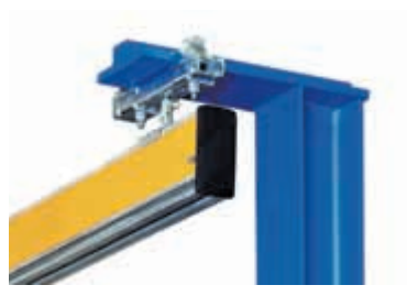
Gallows supports are the inexpensive alternative to portal support structures. They are produced to individual height specifications and can be quickly set up with little installation effort. There are single-sided and double-sided (T-support) gallows to which the crane tracks are attached.